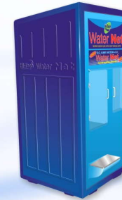
Water Vending Machine

High Turbidity & heavy Hardness of water will cause sudden chock up of cartridge filters & membrane. So extra sized sand filter & anti-scalent dosing pump is added for longer life of membranes.