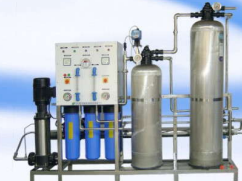
R.O. Deluxe with high turbidity & heavy Hardness remover dosing pump

High Turbidity & heavy Hardness of water will cause sudden chock up of cartridge filters & membrane. So extra sized sand filter & anti-scalent dosing pump is added for longer life of membranes.