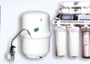
R.O. 10 / 15