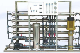
RO 10000 Fully SS Deluxe