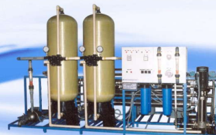
Large R.O. System

All our various R.O. Systems are designed & manufactured in such a way that, the plant cause no leakage, less noise, attractive in look & ISI approved. Also having softener, Anti-scalant, pH correction, Chlorination & De-chlorination, Iron removal & other Dosing systems. Built with a good quality material of SS316 & CPVC pipelines & fittings.