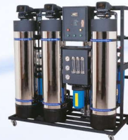
Ultra Deluxe with Mobility

Our rich experienced Technical Designers of Reverse Osmosis have designed various R.O. plants for various source water.