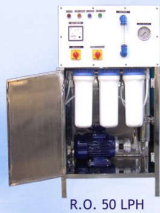
R.O. 50 LPH

CORPORATE HOUSES & BANKS, HOTELS & RESTAURANTS : These R.O. Systems provides purest drinking water to you, to your employees and your valuable customers. Plants are economical designed to give the output of pure drinking water @ 10 paisa per liter which helps you to increase your customers list as well as can make delicious food.